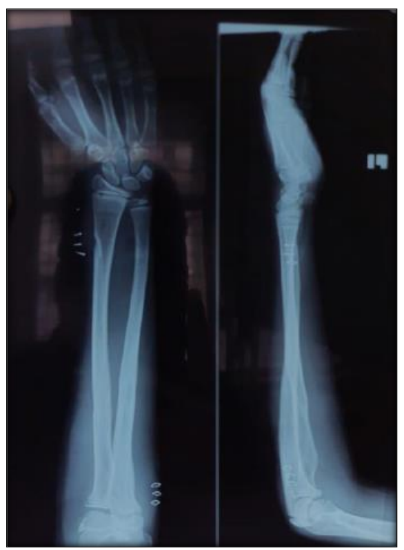
Figure 5: Post Implant removal

Institutional ethics and Institutional research board approval were obtained before the commencement