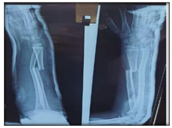
Figure 1: Pre-op x-ray showing displaced both bone forearm fracture

Postoperatively, an above-elbow slab was given to encourage soft tissue healing. Parenteral antibiotics were given for three days, then oral antibiotics were changed. Active finger and elbow exercises were started at the earliest possible. Implant removal was done six months postoperatively after seeing the radiological union. The patients were followed up for a minimum period of 6 months. The subjective, objective, and radiographic findings were quantified according to Price et al.'s criteria and radiological findings.