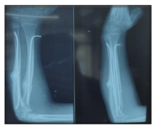
Figure 3: Post-op 4 weeks