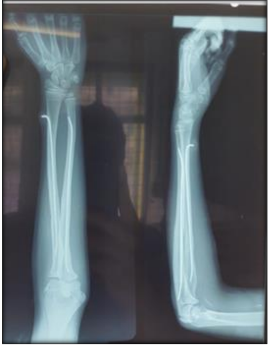
Figure 4: 3 months post-op- fracture united well. Normal ROM of wrist and elbow