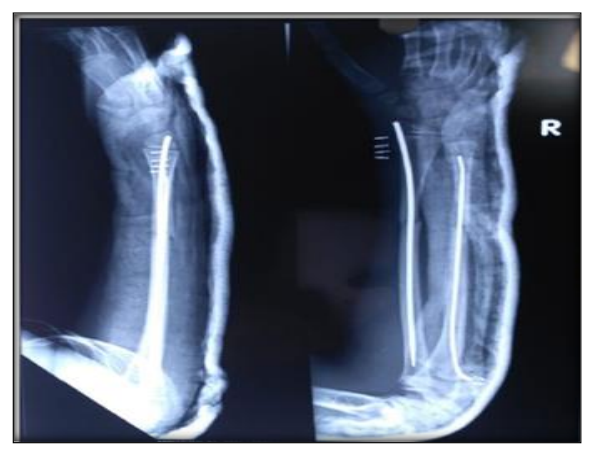
Figure 2: Post-op: TENS nailing done